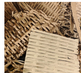
Shredded cardboard used for packaging protection

We are currently utilizing a cardboard shredder, allowing us to reuse all the packaging materials we receive. This means that any packaging we receive will either be utilized in creating new packaging or shredded and repurposed for packaging protection.